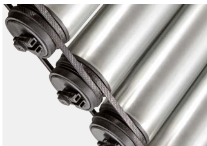
Optimal absorption of drive vibrations

If you do not find the required length in our comprehensive product range, please contact our technical department.