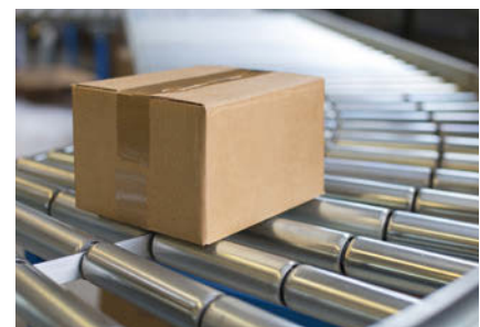
Suitable for curved path