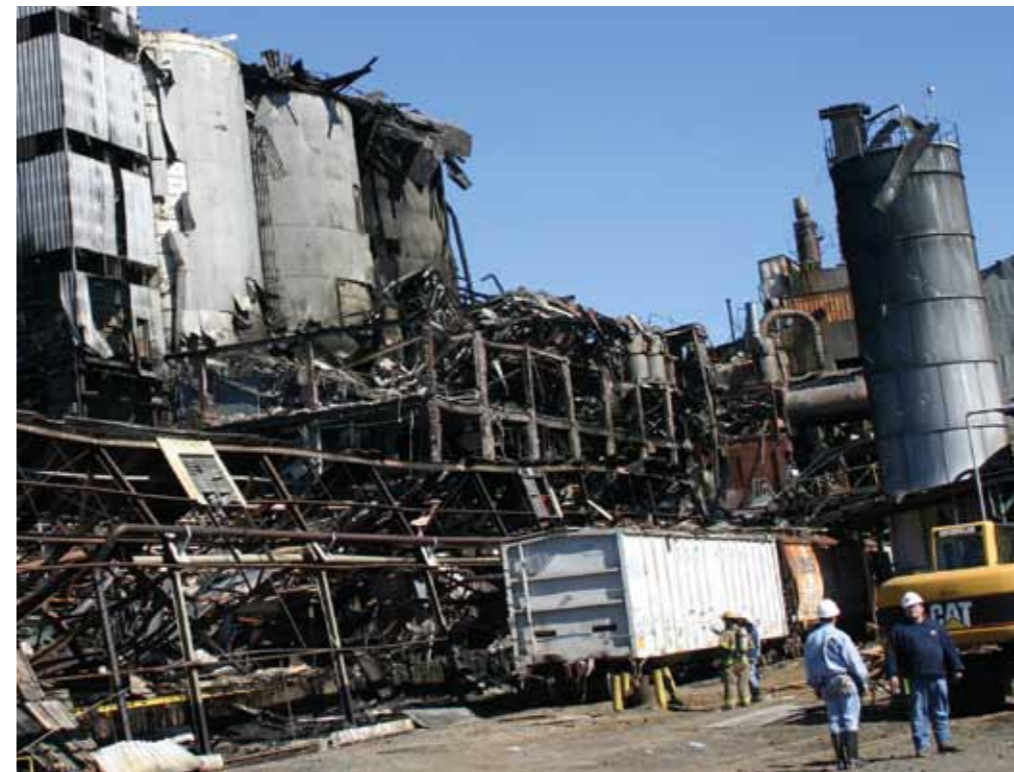
Aftermath of a dust explosion and resulting fire in the bulk and process industry

We offer you complete advice with a clear (problem) analysis, the right design and solution, proper installation and long term planning for maintenance.