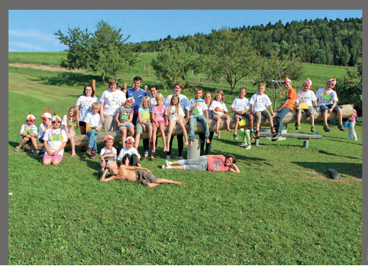
Schmalz children's holiday program