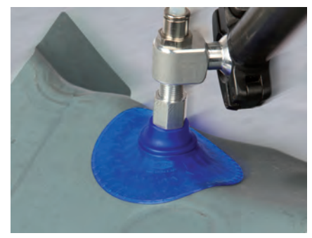
Vacuum technology since 1984