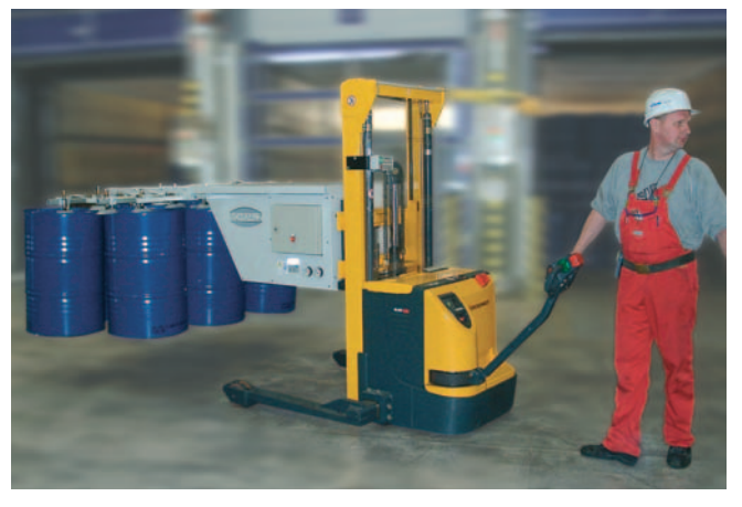
VacuMaster, maximum load 140 kg, for moving barrels from a vehicle discharge point to a conveyor belt