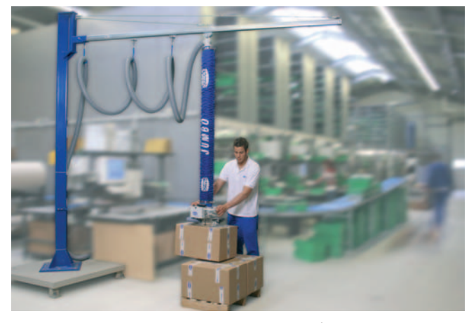
JumboSprint, maximum load 45 kg, with dual suction pad, for handling cardboard boxes