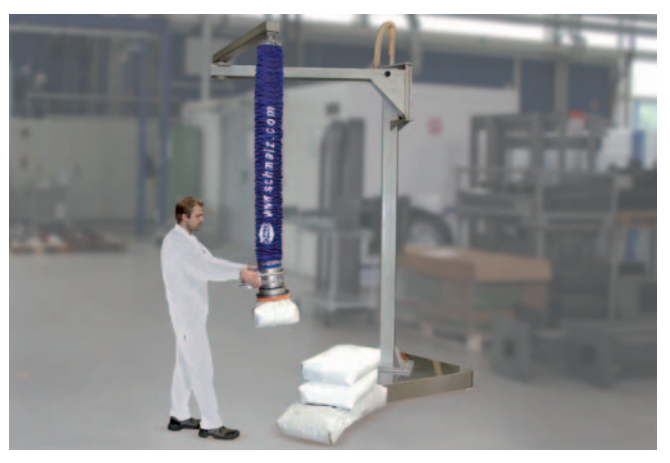
Stainless-steel articulated-jib crane with Jumbo