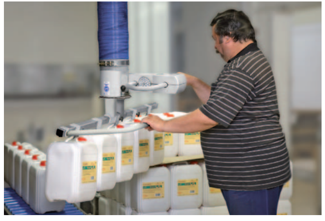
JumboErgo, maximum load 65 kg, for unstacking five canisters on a roller conveyor