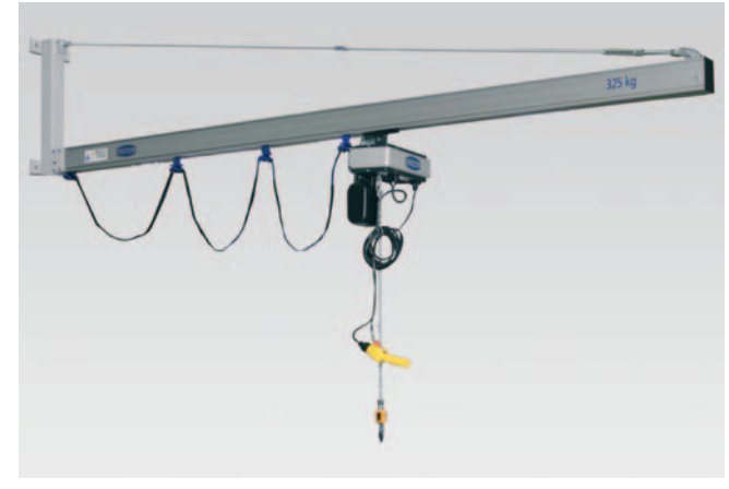
Wall mounted jib crane with chain hoist