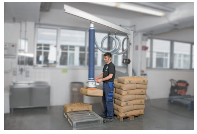
JumboSprint, maximum load 65 kg, with sack gripper, for commissioning of plastic and paper sacks