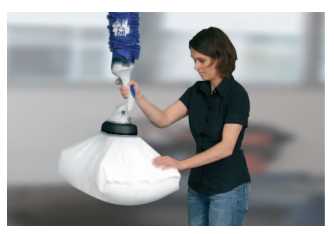
JumboFlex, maximum load 35 kg, with sack gripper, for handling plastic sacks weighing up to 25\ kg