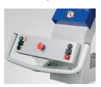
Operator handle Comfort