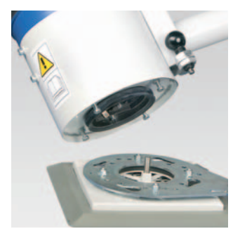
Quick-change adapter SWA

• Twist grip fast handling (similar to that on a motorcycle)