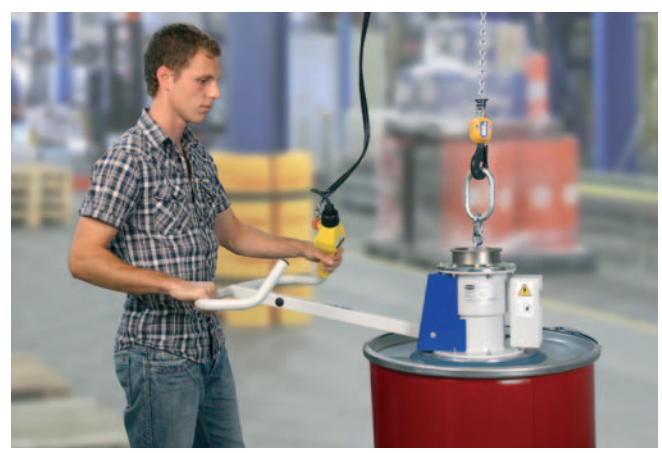
VacuMaster Eco, maximum load 250 kg, for barrel handling