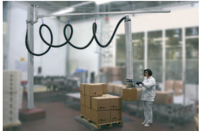
JumboSprint, maximum load 45 kg, with single suction pad, for handling cardboard boxes in an explosion-proof area in accordance with ATEX