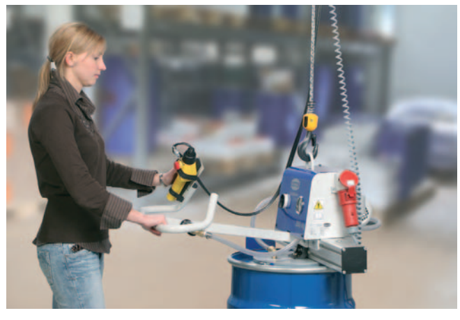
VacuMaster Basic, maximum load 250 kg, horizontal, for handling of barrels