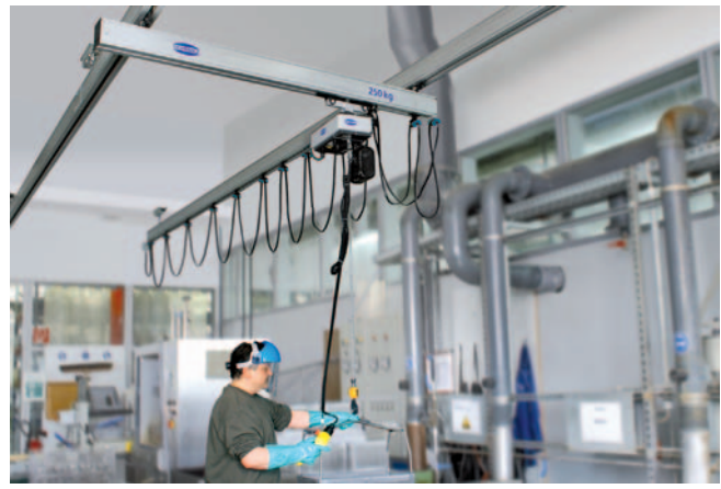
Aluminium crane system with chain hoist