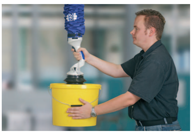
JumboFlex, maximum load 35 kg, with round suction pad, for handling of buckets