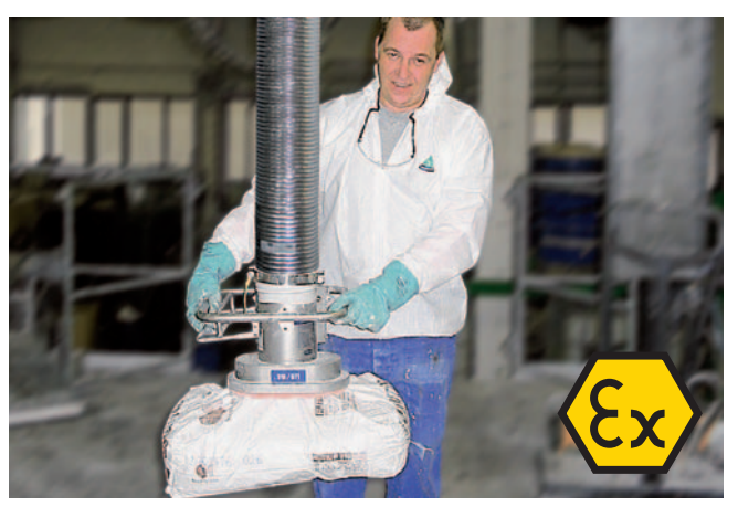
JumboSprint, maximum load 65 kg, with sack gripper, for handling sacks in explosion-proof areas to ATEX