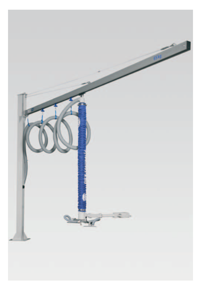
Column mounted jib crane with Jumbo