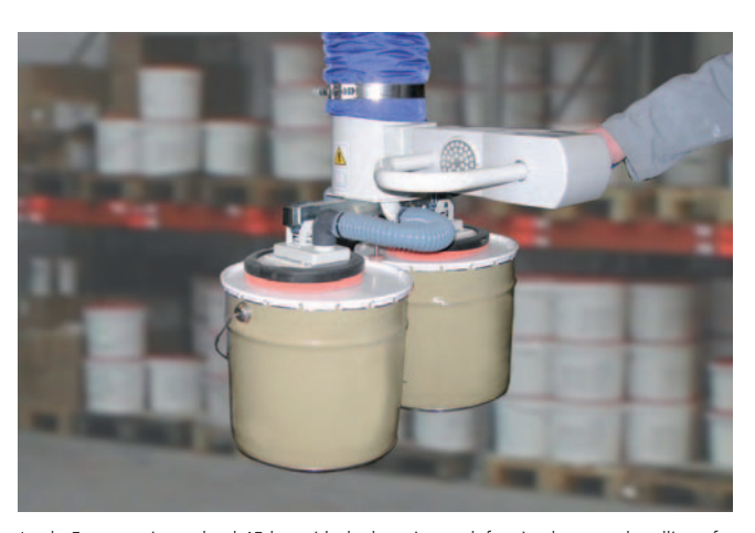
JumboErgo, maximum load 45 kg, with dual suction pad, for simultaneous handling of two buckets