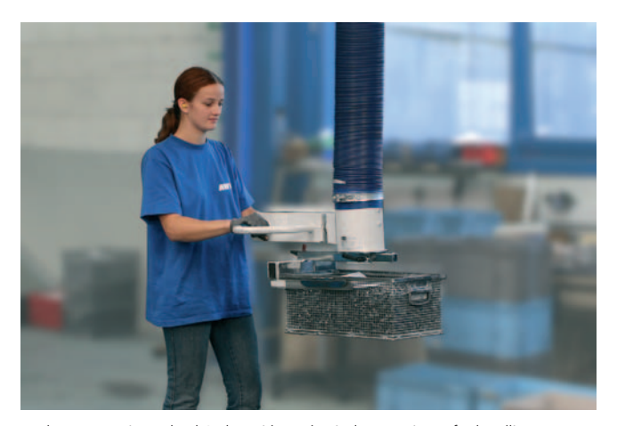
JumboErgo, maximum load 65 kg, with mechanical crate gripper, for handling metal boxes