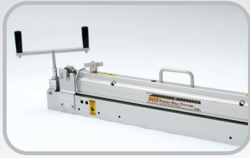
900 Series Belt Cutter