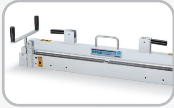
845LD Belt Cutter