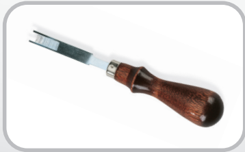
Rough Top Belt Skiver