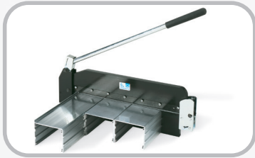
350 mm (14") Belt Cutter