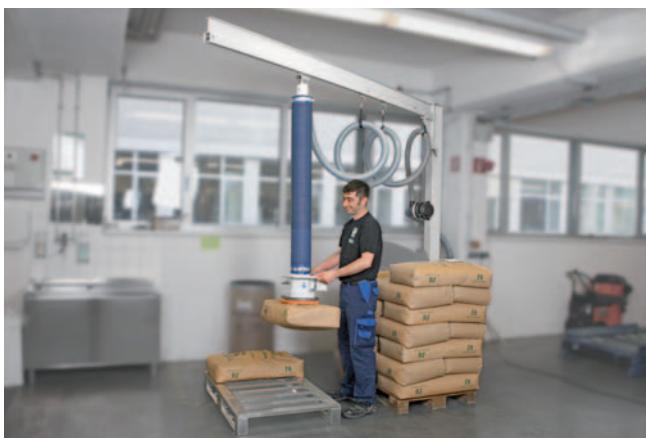
JumboSprint, maximum load 65 kg, with sack gripper, for commissioning of plastic and paper sacks