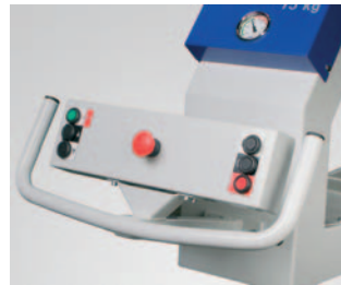
Operator handle Comfort