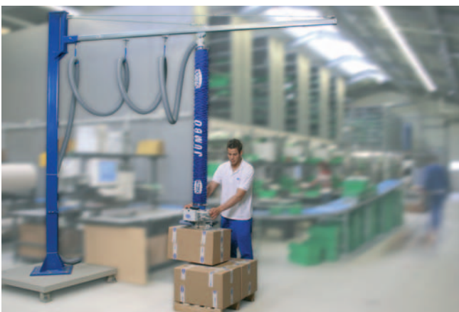
JumboSprint, maximum load 45 kg, with dual suction pad, for handling cardboard boxes