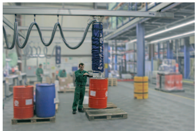
JumboErgo, maximum load 300 kg, with round suction pad, for handling barrels