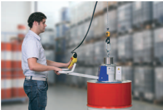
VacuMaster Eco, maximum load 250 kg, horizontal, for handling of barrels