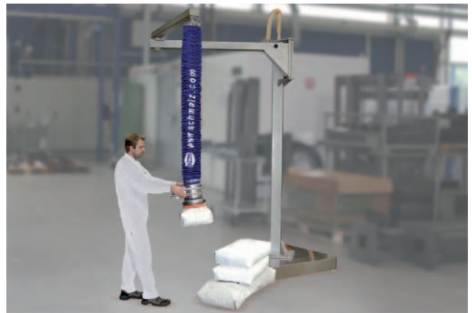
Stainless-steel articulated-jib crane with Jumbo