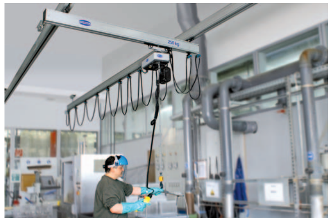
Aluminium crane system with chain hoist