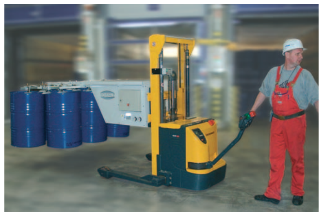
VacuMaster, maximum load 140 kg, for moving barrels from a vehicle discharge point to a conveyor belt