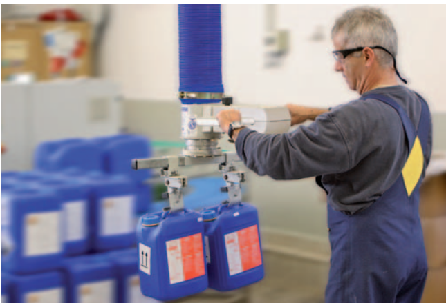
JumboErgo, maximum load 45 kg, for commissioning of canisters