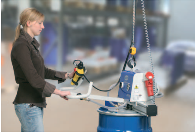
VacuMaster Basic, maximum load 250 kg, horizontal, for handling of barrels

The trendsetting generation of vacuum lifting devices