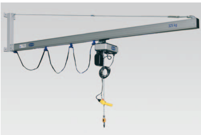
Wall mounted jib crane with chain hoist