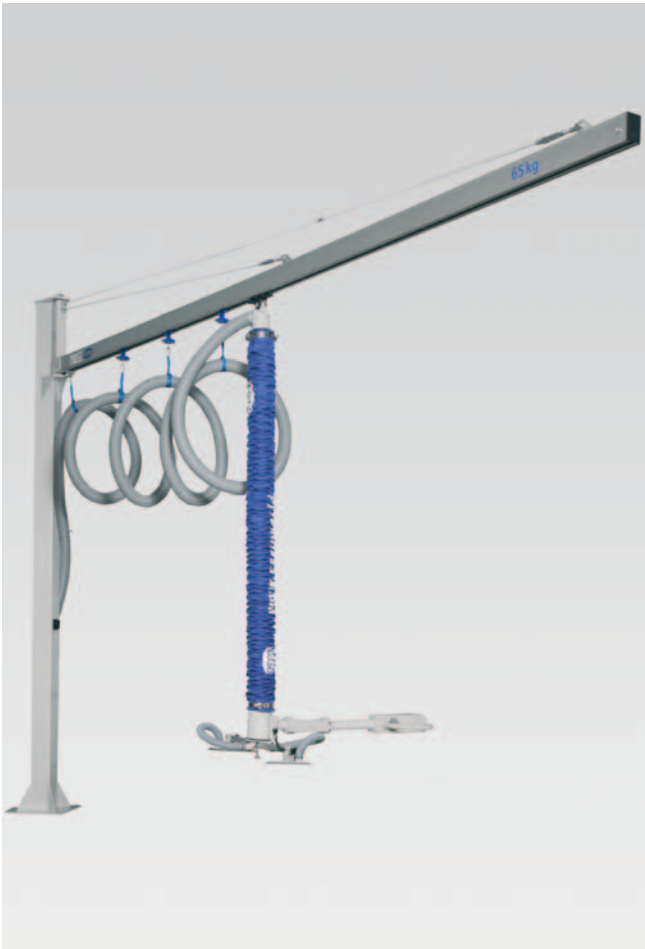
Column mounted jib crane with Jumbo