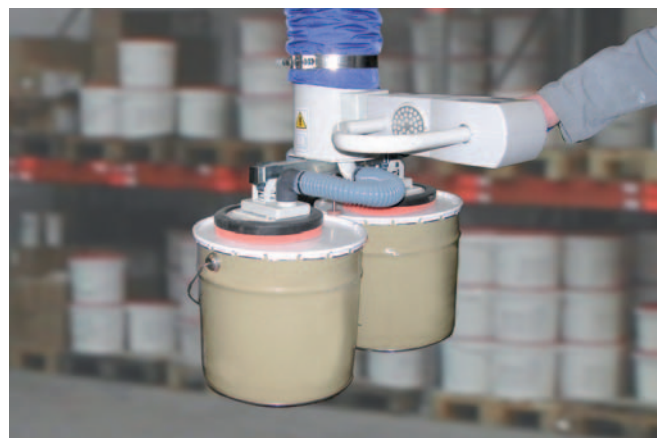
JumboErgo, maximum load 45 kg, with dual suction pad, for simultaneous handling of two buckets