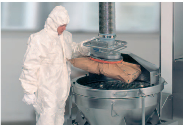
JumboSprint, maximum load 65 kg, with sack gripper, for handling sacks in an explosion-proof area in accordance with ATEX