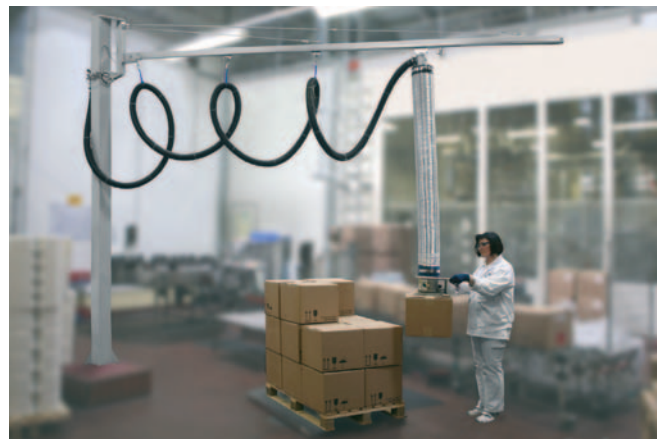
JumboSprint, maximum load 45 kg, with single suction pad, for handling cardboard boxes in an explosion-proof area in accordance with ATEX