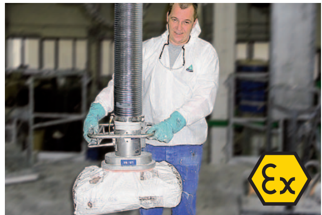
JumboSprint, maximum load 65 kg, with sack gripper, for handling sacks in explosion-proof areas to ATEX