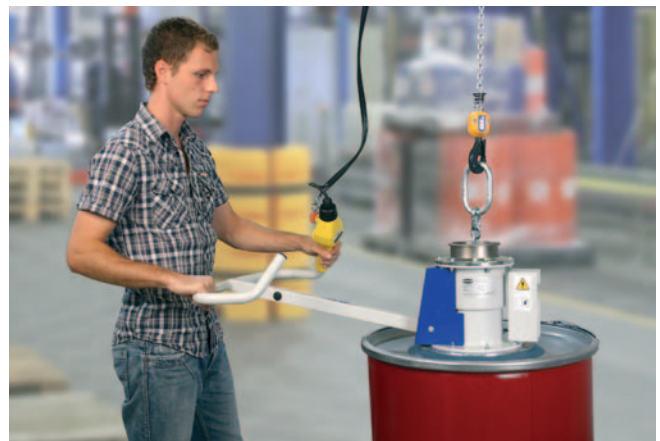
VacuMaster Eco, maximum load 250 kg, for barrel handling