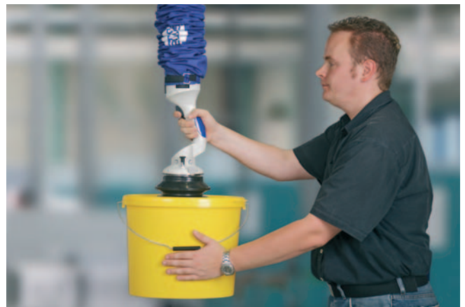
JumboFlex, maximum load 35 kg, with round suction pad, for handling of buckets