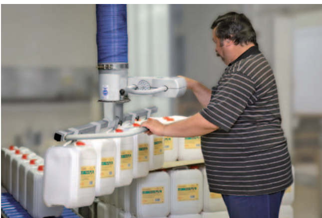
JumboErgo, maximum load 65 kg, for unstacking five canisters on a roller conveyor