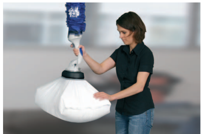
JumboFlex, maximum load 35 kg, with sack gripper, for handling plastic sacks weighing up to 25 kg