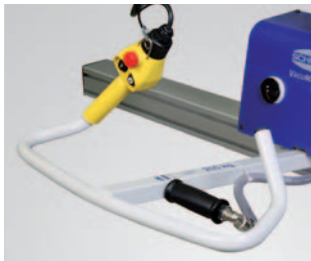
Operator handle Basic