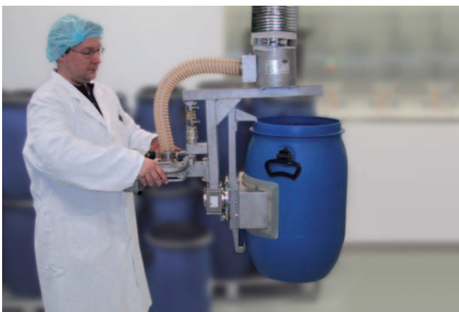
JumboErgo, maximum load 85 kg, with side gripper, for handling and emptying barrels