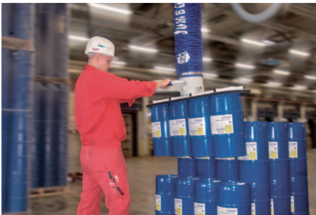
JumboErgo, maximum load 140 kg, with customer-specific gripper solution, for simultaneous handling of four barrels