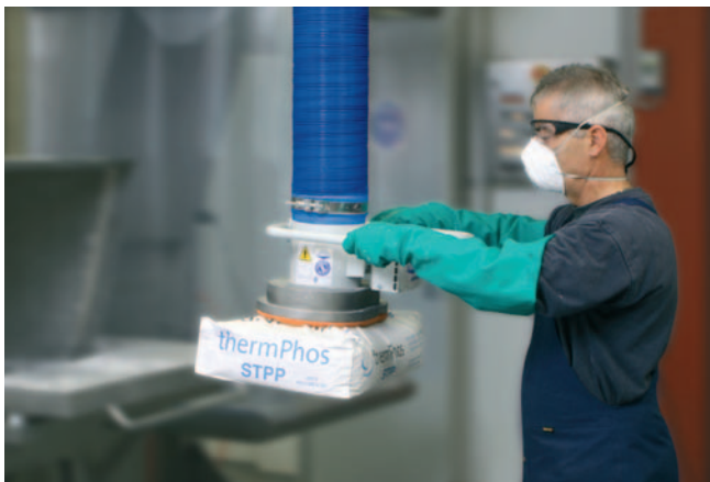
Jumbo Sprint, maximum load 45 kg, with sack gripper, for handling plastic and paper sacks