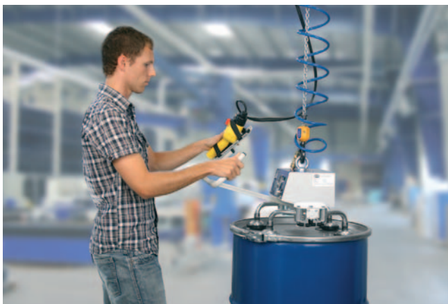
VacuMaster Light, maximum load 100 kg, horizontal, for handling of barrels