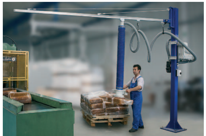
JumboSprint, maximum load 65 kg, with vacuum sack gripper, for handling bales of raw rubber