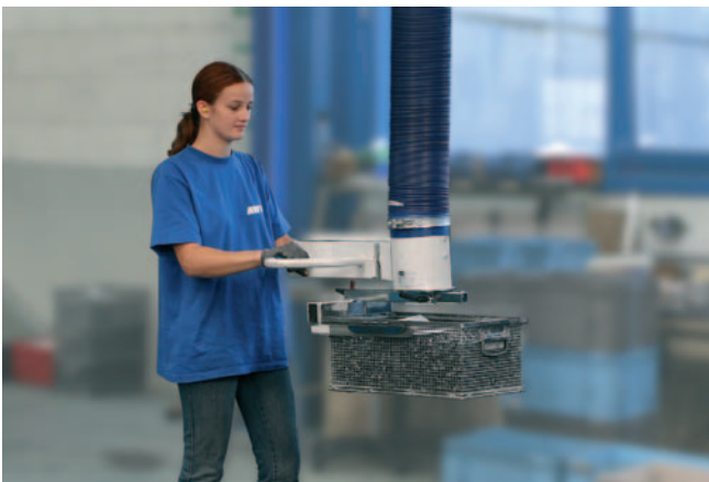
JumboErgo, maximum load 65 kg, with mechanical crate gripper, for handling metal boxes